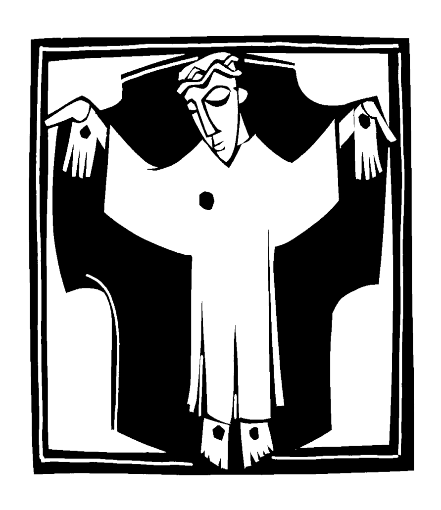
Good Friday March 29, 2024