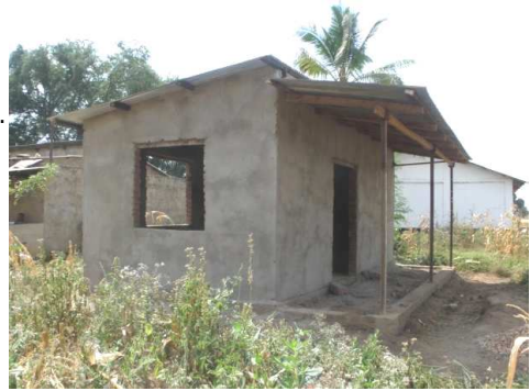
Future home of new oil press

We are preparing to open another oil press soon! Our second one! The press has been fabricated and the United Women of Kimamba Parish have built a building in anticipation of housing the project. Our hope is that by the second week of September the press will be open. There is still a fair amount of work to do but I'm confident that it will go well. The sunflower harvest was modestly successful and farmers have just harvested their crop. Now if only my favorite electric supply company, TANESCO, is quick to hook up the 3-phase electrical connection, we will be in business.