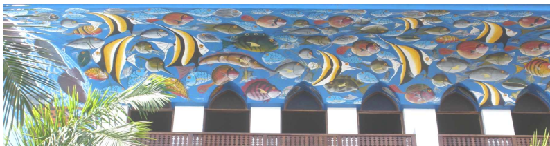
Fish abound! Tingatinga style mural, Slipway, Dar es Salaam

I was shocked to discover that SIX MONTHS have passed since the last time I sent out a newsletter. Mea culpa! Nonetheless, I shall plunge ahead and bring you up to date on what is happening in this corner of the world. I'm afraid this will be more like a novel than a newsletter.