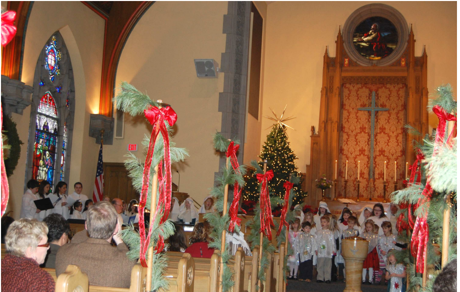
Stars, Angels and Shepherds!