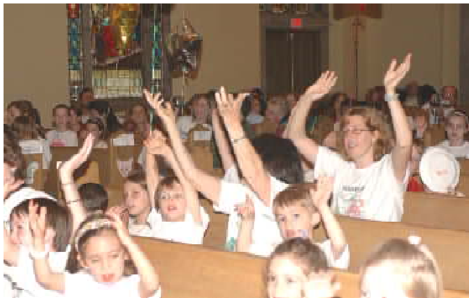
Closing ceremony in the sanctuary