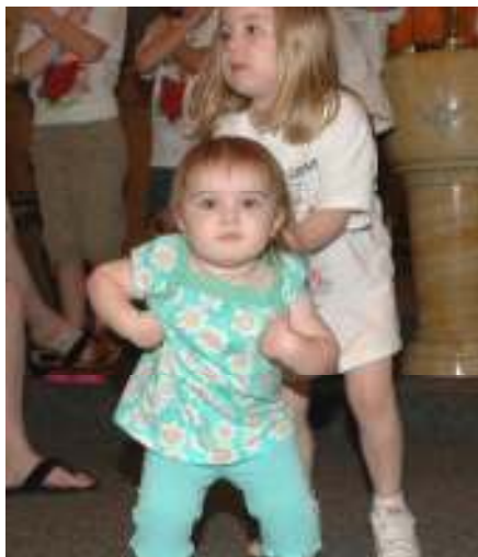
Gettin' in the groove!