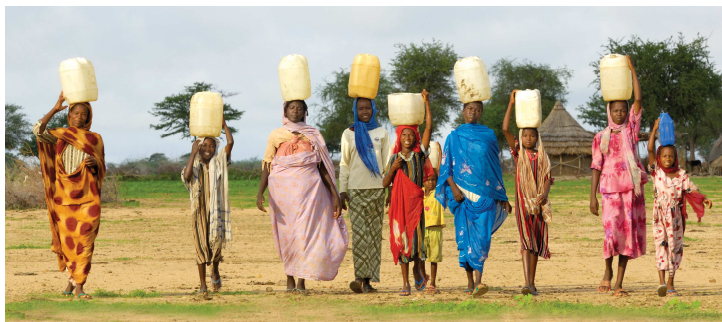
Women and girls carry water home in Geles, an Arab village in Darfur.

You and I can make a difference helping those who are less fortunate to have more food, more education, and more clean water to drink by joining the Ardmore/Main Line Crop Walk on Sunday, October 16 . This is the 33rd d annual Main Line Walk! We will meet at the Suburban Square parking lot (in Ardmore, across from Ruby's) for the 10k (6.2 mile) walk. If you are not sure you can walk the entire distance, the route is west on Lancaster Ave., returning east via Montgomery Ave., so you can turn around at any point, if need be. Each participating church is asked to provide a crossing guard.